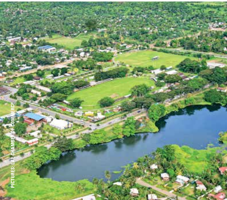
Bird's-eye view ... an aerial perspective of Lae (above); scenes from Tami Islands (this page and following page).