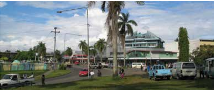
Street scene ... Lae is PNG’s second-largest city.

11 Lae is home to the Papua New Guinea University of Technology, which houses the Matheson Library – the largest technological library in the South Pacific. ‘Unitech’, as the university is known, has a small public exhibition of rare and valuable artefacts, as well as a rainforest habitat with birds, snakes and tree kangaroos on display. See unitech.ac.pg .